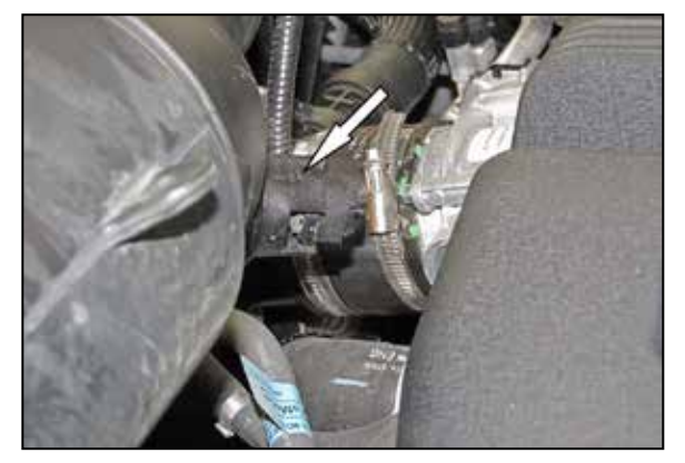
2. Disconnect the inlet air temperature sensor electrical connector and remove the tape around the harness connector.

3. Loosen the hose clamp that secures the factory intake tube to the upper air filter housing.