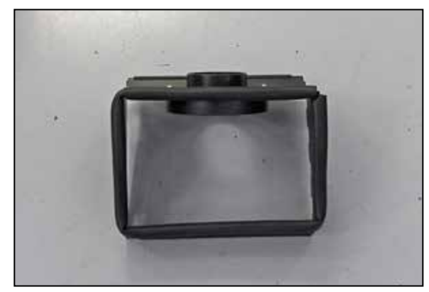
9. Install the K&N® filter adapter into the heat shield and secure with the provided hardware.

NOTE: Some trimming of the edge trim will be necessary.