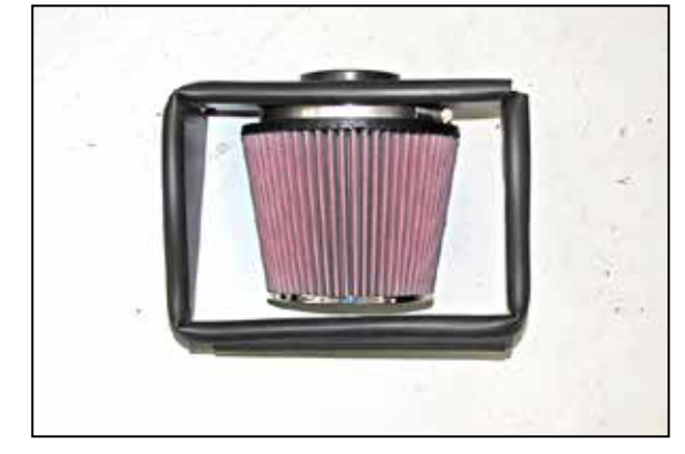
10. Install the K&N® air filter onto the filter adapter and secure with the provided hose clamp.