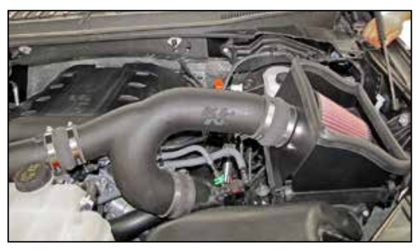
19. Reconnect the vehicle's negative battery cable. Double check to make sure everything is tight and properly positioned before starting the vehicle.

20. The C.A.R.B. exemption sticker, (attached), must be visible under the hood so that an emissions inspector can see it when the vehicle is required to be tested for emissions. California requires testing every two years, other states may vary.