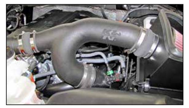
17. Install the K&N® intake tube into the couplers at the turbo inlet tubes and then into the coupler at the filter adapter, adjust the tubes for best fit and then secure with the provided hose clamps.