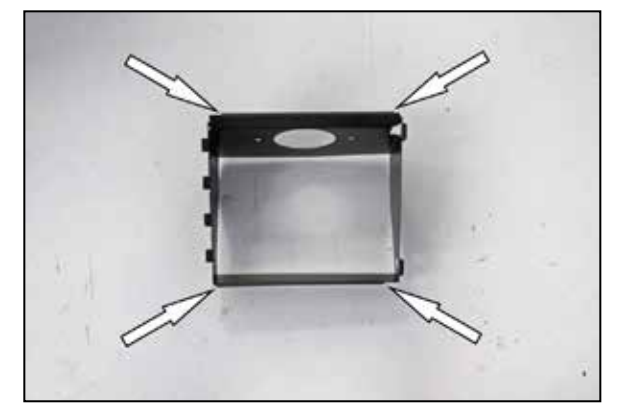
7. Install the small edge trim onto the bottom of the heat shield as shown using the provided super glue to secure it in place.