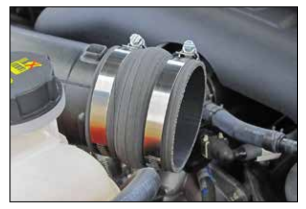
14. Install the provided coupler hose (087121) onto the passenger side turbo inlet hose and secure with the provided hose clamp.