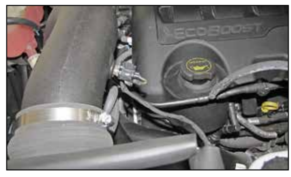
18. Reconnect the inlet air temperature sensor electrical connection using the provided extension harness.