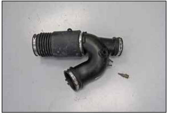
15. Remove the inlet temperature sensor from the factory intake tube.