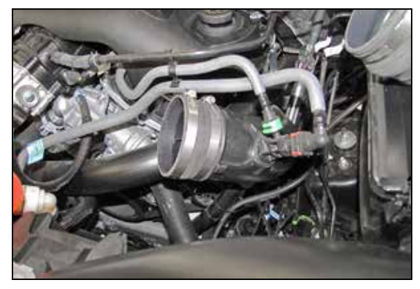
13. Install the provided coupler (08761) onto the driver's side turbo inlet tube and secure with the provided hose clamp.

12. Install the provided hump coupler (08699) onto the filter adapter and secure with the provided hose clamp.